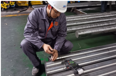
Hardness tester test